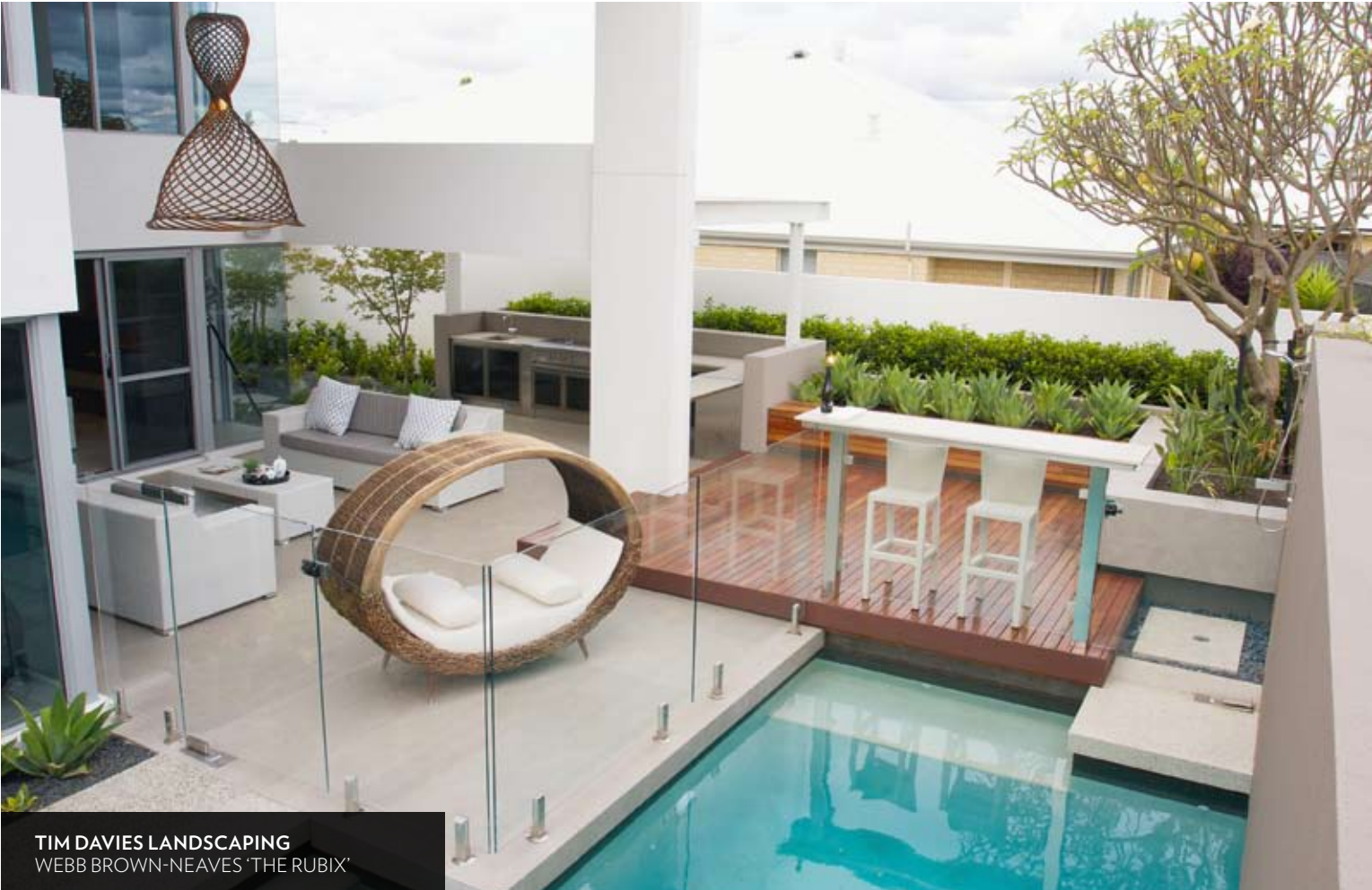
TIM DAVIES LANDSCAPING WEBB BROWN-NEAVES 'THE RUBIX'

NEWFORMS LANDSCAPE ARCHITECTURE Newforms, along with Phase 3 Landscape Construction, created this sensory and interactive garden. Good use of recycled materials is seen in the retaining and randomly shaped stepper slabs, instead of the typical rectangular pavers. Judges said it is a kid-friendly backyard that offers a sense of adventure.