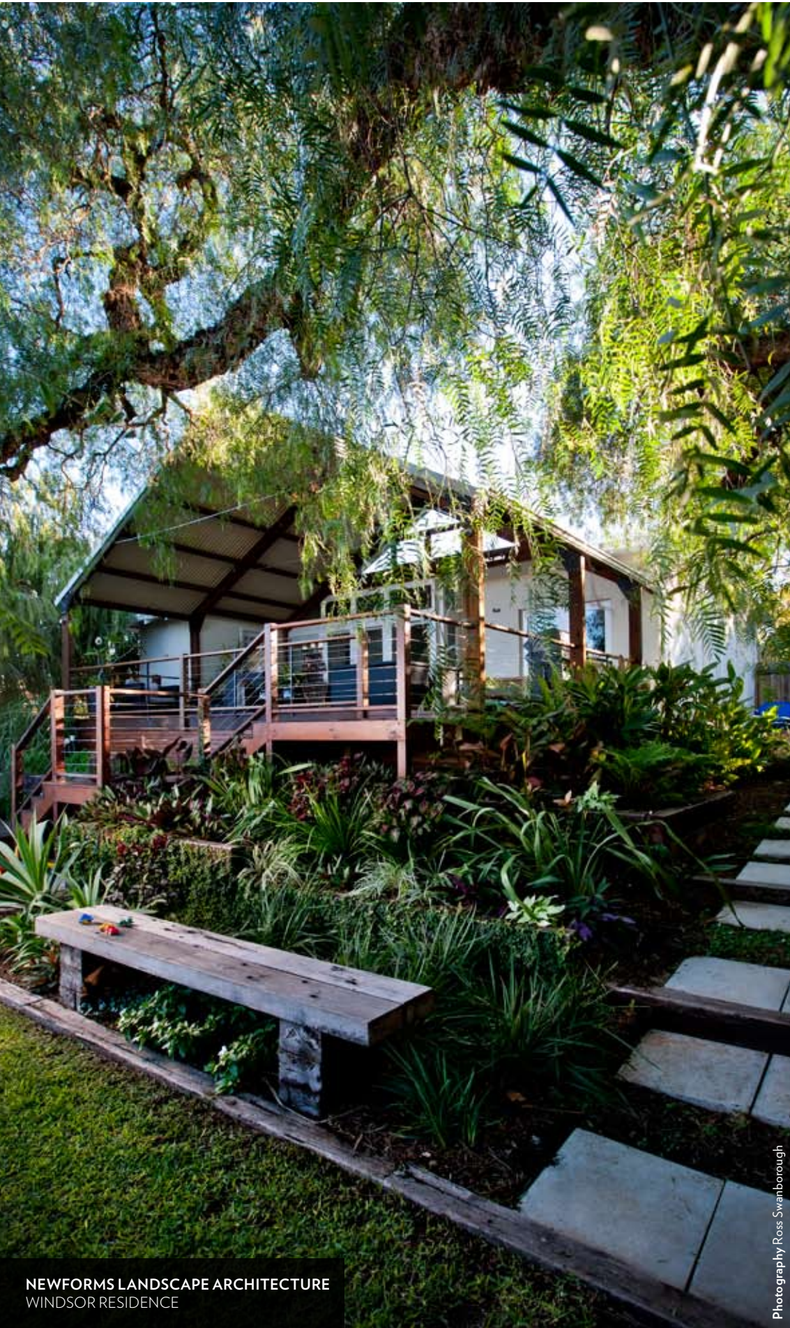
NEWFORMS LANDSCAPE ARCHITECTURE WINDSOR RESIDENCE