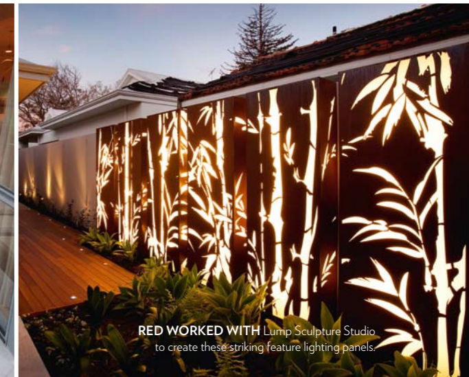
RED WORKED WITH Lump Sculpture Studio to create these striking feature lighting panels.