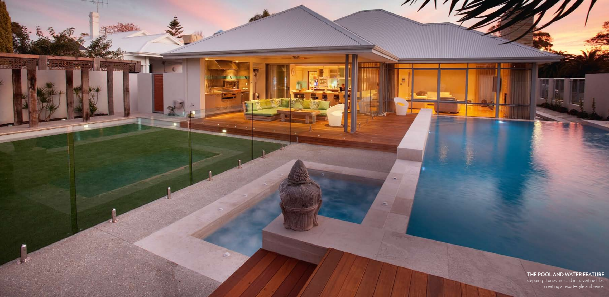
THE POOL AND WATER FEATURE stepping-stones are clad in travertine tiles, creating a resort-style ambience.

A focus on the finer details means that landscapes designed and constructed by Ritz Exterior Design are nothing short of stunning.