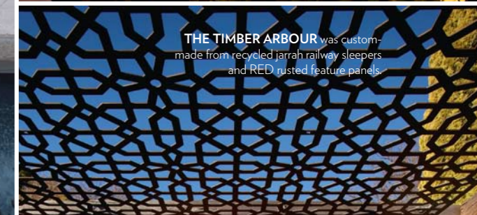
THE TIMBER ARBOUR was custom-made from recycled jarrah railway sleepers and RED rusted feature panels.